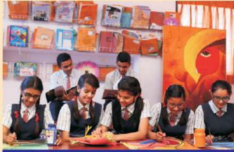
All Round Growth and Inculcation of Soft Skills