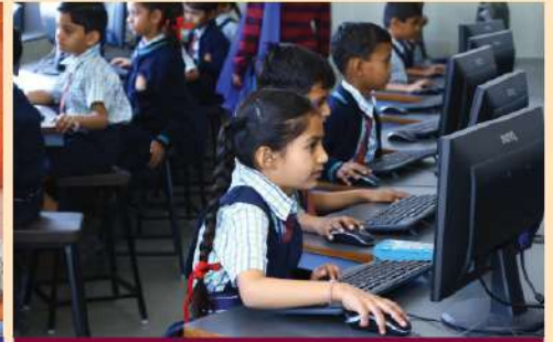
Equipped with Smart Classes & Labs