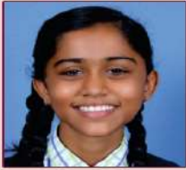
Miss Tisha X F, U-16 Girls