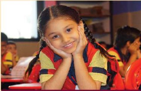
Burden Free Learning