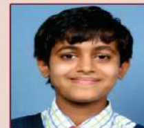
Miss Shakshi VIII B, U-14 Girls