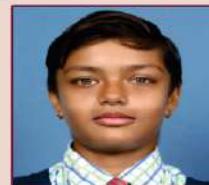
Miss Khushi VIII B, U-14 Girls