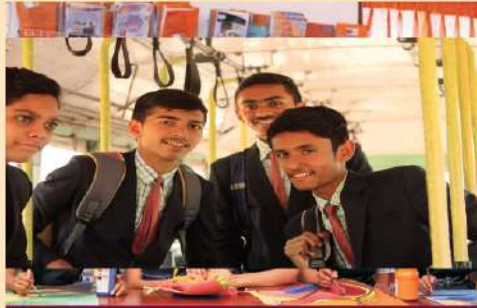
Emphasis on Personality Development