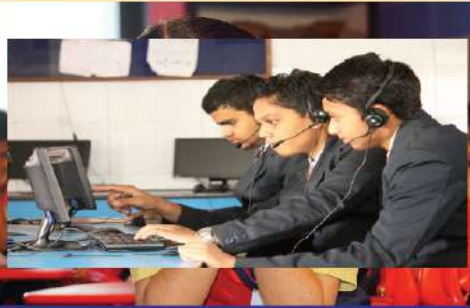
Emphasis on Communication Skills