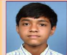
Master Devraj VII E, U-14 Boys

If you are a true warrior - competition doesn't scare you. It makes you better