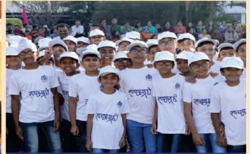
Best Swachhagrahi school in the State of Gujarat